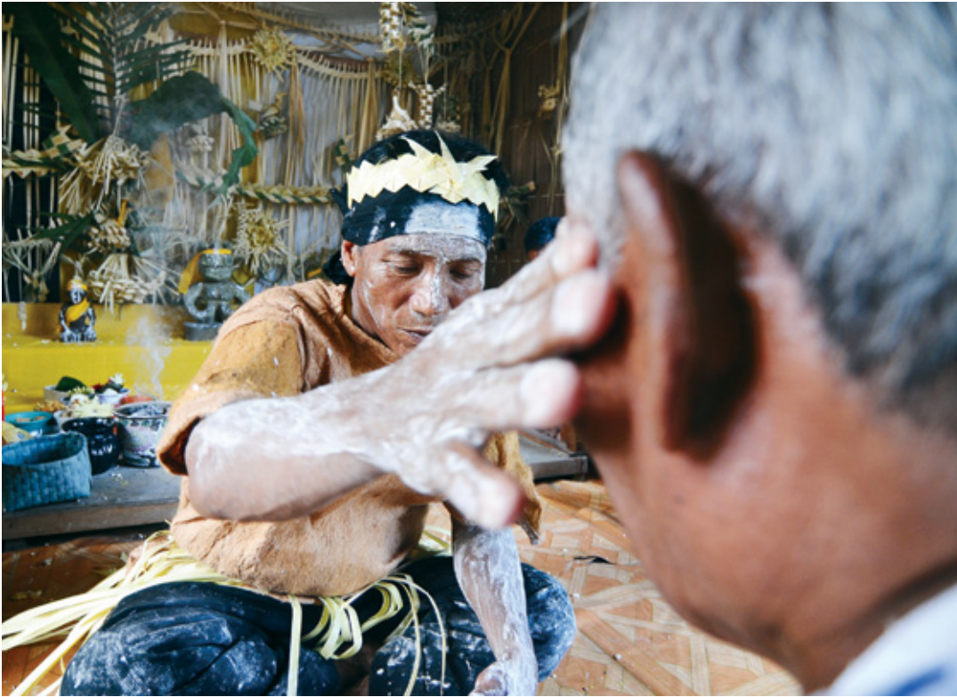
Ritual is an important part of a psilocybin session. Researchers today carefully survey a patient's mental and physical landscape to channel the drug's effects toward healing.

ized psychological measurements of depression and mood, as well as screening for other psychiatric symptoms, such as paranoia and grandiosity.